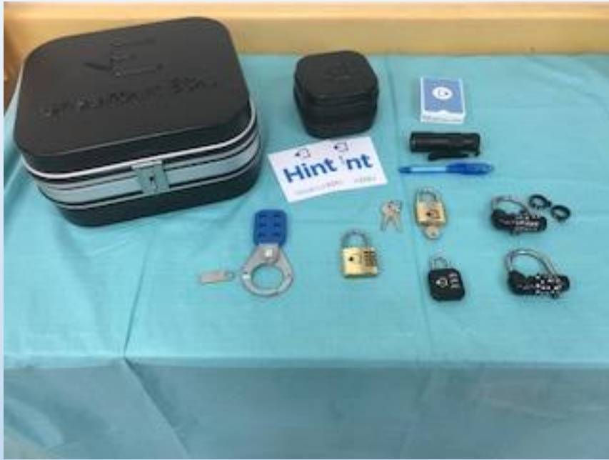
What we started with: