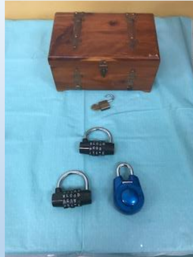
What we added: